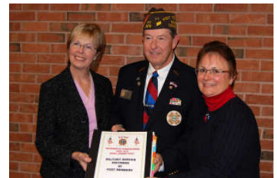
Presentation of local Veterans histories to the Hunter History Room at the Avon Free Public Library by VFW Post 3272.